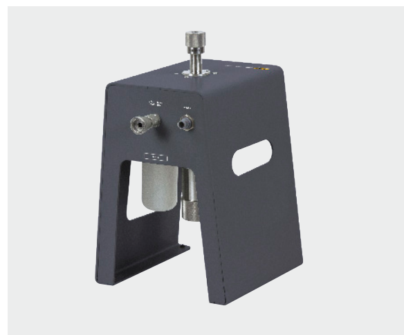
The Contamination Prevention System acts as a test stand for connecting units under test, as well as for preventing contamination from reaching the 2271A.

Visit www.flukecal.com for more information about Fluke Calibration products and services.