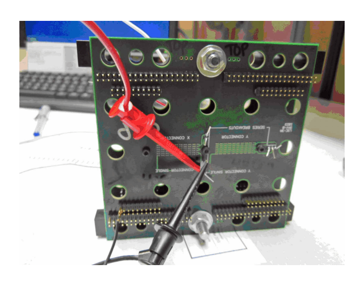
Figure 4 Contact Resistance, Rated Current Measurement Points