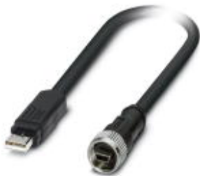
Assembled USB cable, shielded, color: black, PVC outer sheath, USB mini-B/IP20 on USB type A/IP20, length: 1 m

Please be informed that the data shown in this PDF Document is generated from our Online Catalog. Please find the complete data in the user's documentation. Our General Terms of Use for Downloads are valid ( http://download.phoenixcontact.com )