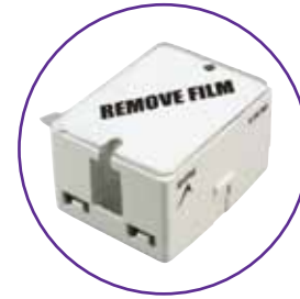
Optional Thermal Pad (SSR-TP-1) Section 3 p.21

We at Magnecraft strive to be your one-stop-shop for all of your solid state relay needs. The new line of 6 series solid-state relays give industrial relay users an energy-efficient current switching alternative. Depending on the application, these solid-state relays offer a number of advantages over electromechanical relays, including longer life cycles, less energy consumption and reduced maintenance costs. This is why great care and attention was given when developing the next generation of "Hockey Puck" style SSRs. These new SSRs will be finger-safe, fit a pre-cut heat transfer thermal pad (sold separately) and have the ability to be mounted onto a factory tested pre-drilled and tapped heat sink (sold separately).