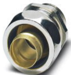
Cable gland made from brass with metric thread, IP40 protection

Please be informed that the data shown in this PDF Document is generated from our Online Catalog. Please find the complete data in the user's documentation. Our General Terms of Use for Downloads are valid ( http://phoenixcontact.com/download )