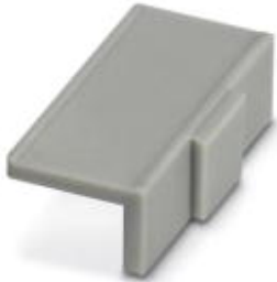
Device marking label, width: 22 mm, area: 22 x 8 mm, e.g. for EML(20x8) R adhesive marking material

Please be informed that the data shown in this PDF Document is generated from our Online Catalog. Please find the complete data in the user's documentation. Our General Terms of Use for Downloads are valid ( http://phoenixcontact.com/download )