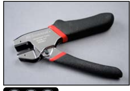
Compatible with all connectors except inline and dropwire connectors