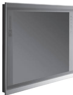
▲ Ultra-slim mechanism design