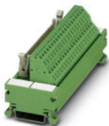
VARIOFACE COMPACT LINE, interface module for 32 channels, for assembly on DIN rail NS 35/7.5, spring-cage connection

Please be informed that the data shown in this PDF Document is generated from our Online Catalog. Please find the complete data in the user's documentation. Our General Terms of Use for Downloads are valid ( http://phoenixcontact.com/download )