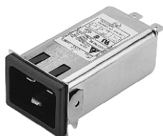
20GENG3E (Optional wire type)