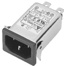
NG3U(H) (With Compact Size)