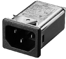
NG3E, NG3C, NG3Q (Optional wire type)