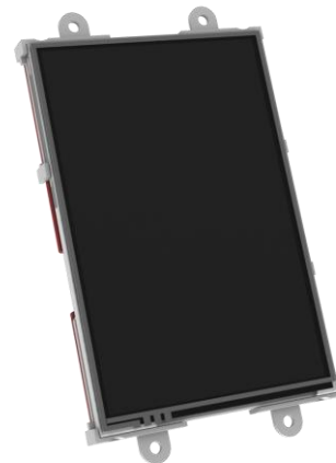
The uLCD-35DT Display Module