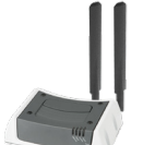
LTE Connectivity Kit