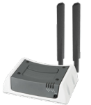
LTE Connectivity Kit