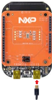
Figure 2: Connect board to computer