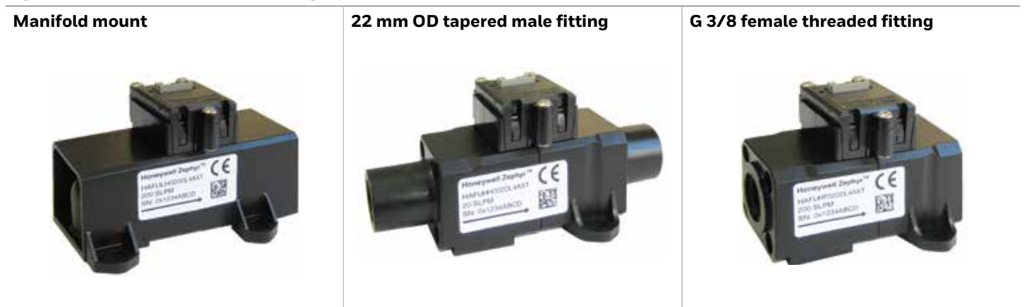
Figure 3. All Available Standard Configurations

1 Apart from the general configuration required, other customer-specific requirements are also possible. Please contact Honeywell.