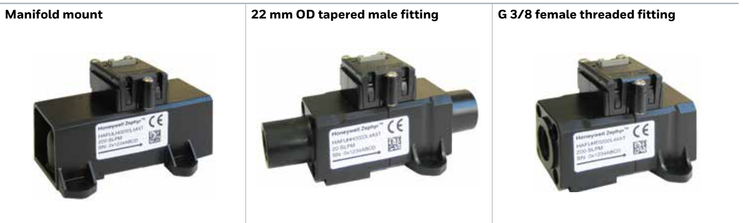
Figure 3. All Available Standard Configurations

1 Apart from the general configuration required, other customer-specific requirements are also possible. Please contact Honeywell.