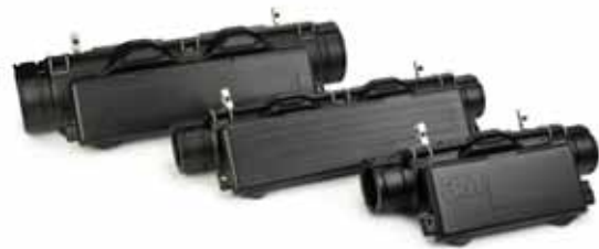
3M™ SLiC™ Terminals 319, 328, 530