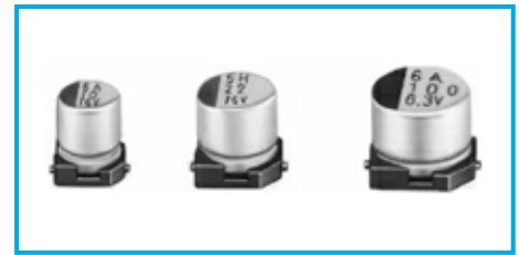
Marking color : Black print