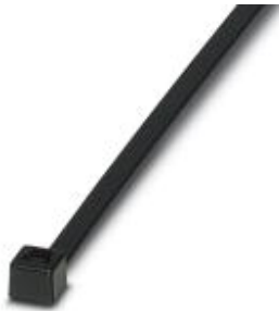
Cable binders for quick and secure bundling, standard version

Please be informed that the data shown in this PDF Document is generated from our Online Catalog. Please find the complete data in the user's documentation. Our General Terms of Use for Downloads are valid ( http://phoenixcontact.com/download )