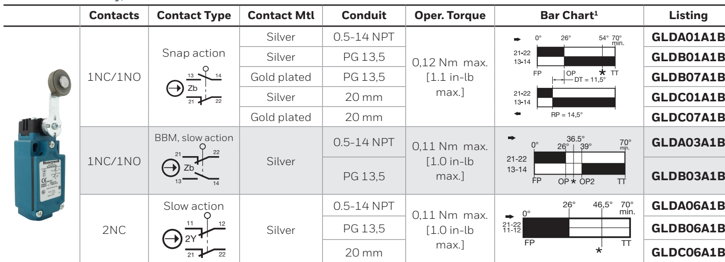
Table 17. Side Rotary, Metal Roller

1 Contact closed ■, Contact open □. *Positive opening occurs.