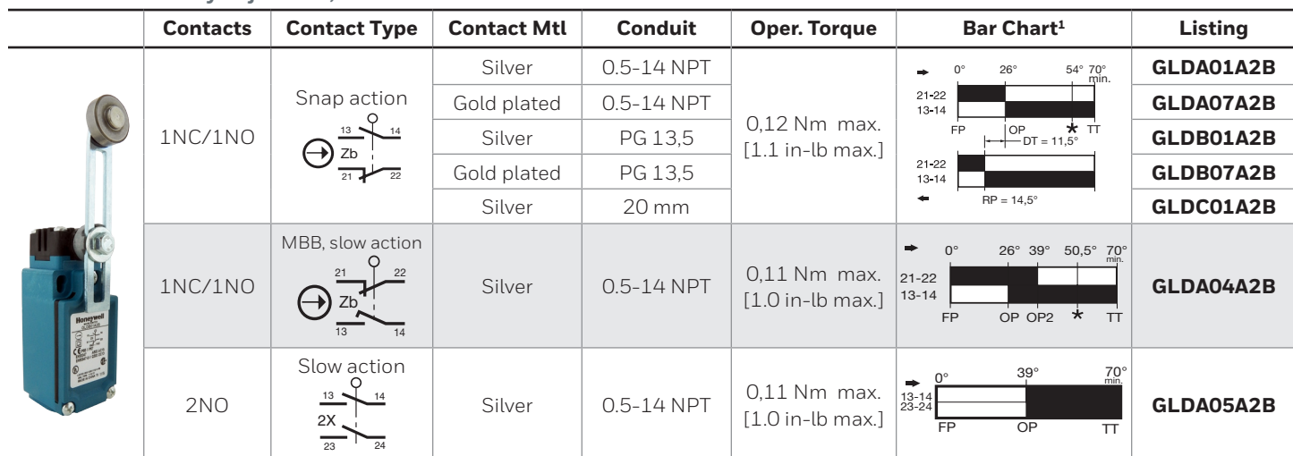
Table 19. Side Rotary Adjustable, Metal Roller

1 Contact closed ■; Contact open □. *Positive opening occurs.