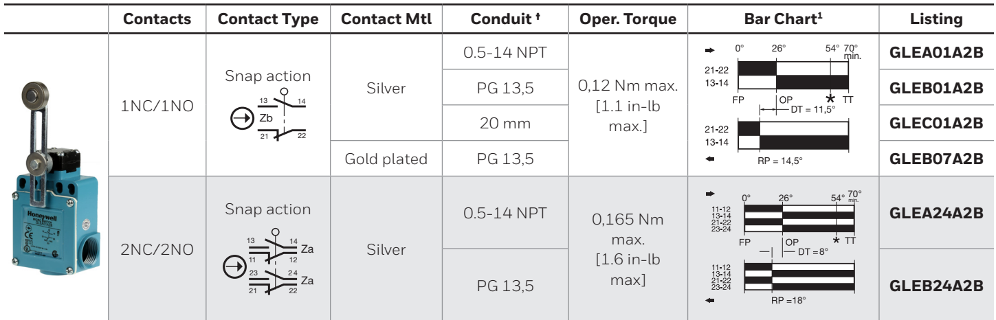
Table 33. Side Rotary Adjustable, Metal Roller