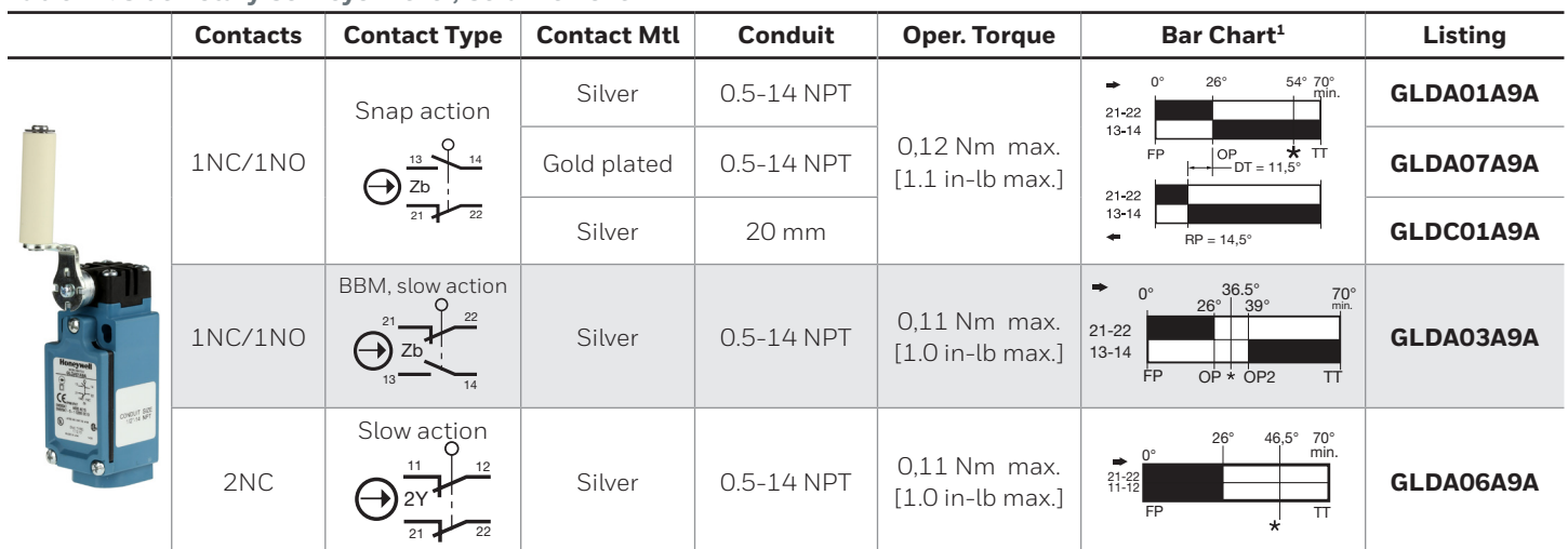
Table 22. Side Rotary Conveyor Lever, Ceramic Roller

1 Contact closed ■; Contact open □. *Positive opening occurs.