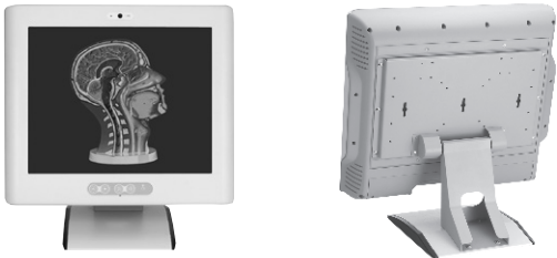
▲ Stand kit