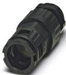
Cable gland, Pg thread, IP68/69k protection, with strain relief

Please be informed that the data shown in this PDF Document is generated from our Online Catalog. Please find the complete data in the user's documentation. Our General Terms of Use for Downloads are valid ( http://phoenixcontact.com/download )