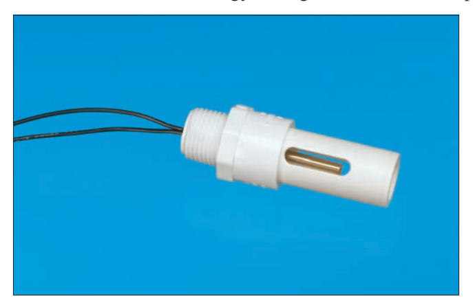
Standard Outdoor Air Temperature Sensor

Standard temp accuracy is ±0.2°C from 0°C to 70°C Resistance versus temperature information for material curve Z can be found on page 59.