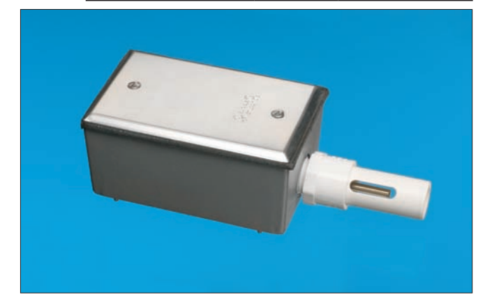
Outdoor Air Sensor with Weatherproof Box