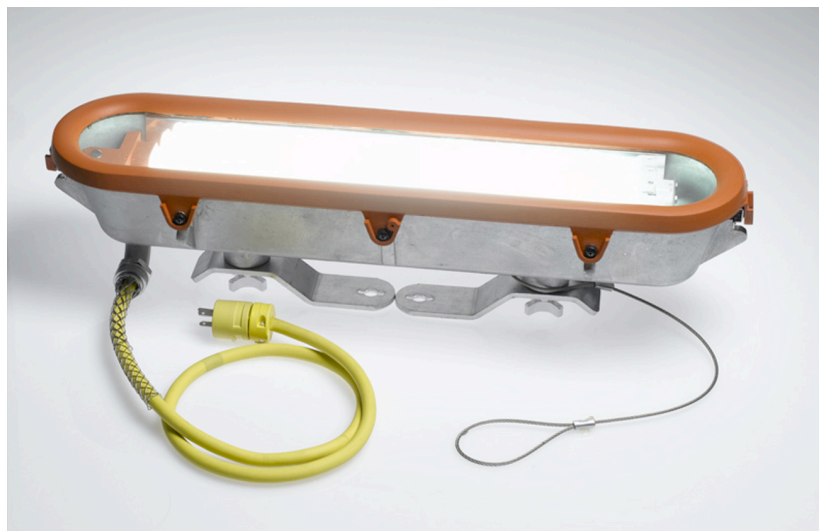
Wide-Area Fluorescent Light For Class I, Division 2 and Zone 2 Applications

For additional product information, please visit: http://www.molex.com/link/widearea.html and http://www.woodhead.com .