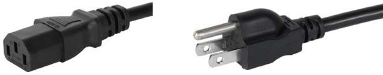
Power plug Japan black