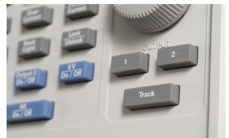
Figure 3. Simplifies Output 1 and Output 2 setup with tracking feature