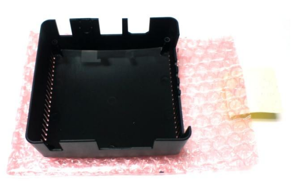
Step 2 (optional)- If you have a Wandboard with Wi-Fi capabilities (Wandboard DUAL). You will need to open the antenna opening