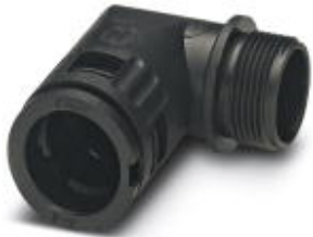
Cable gland, Pg thread, IP66 protection, angled

Please be informed that the data shown in this PDF Document is generated from our Online Catalog. Please find the complete data in the user's documentation. Our General Terms of Use for Downloads are valid ( http://phoenixcontact.com/download )