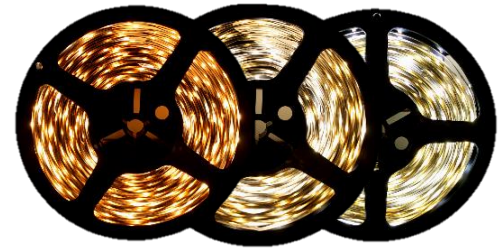
Warm White 3000K Pure White 4200K Cool White 6000K

Inspired LED Flexible Strip Lights are a simple, customizable solution for all of your LED lighting needs. These unique strips can be cut to length and terminated with solderless end connectors for easy DIY installation. Energy efficient, with a wide range of options for brightness and color, LED Flex Strips are the perfect option for any lighting application.